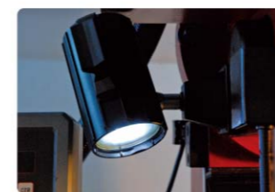
LED working lamp