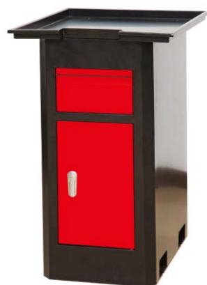
S/N:10244 Overall dimension: 550x835x850mm