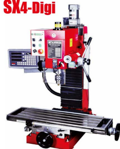
(SX4 bench mill with 3-axis Digital readout)