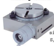
size 150mm S/N:10143