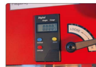
Drilling depth display