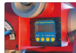
Tilting angle display

With 3-axis Digital readout , power feeder , stand