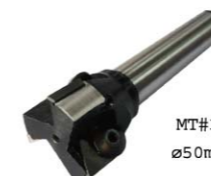
Indexable carbide end mill