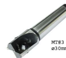
Indexable carbide end mill