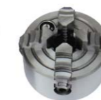
4-jaw chuck (Independent)