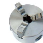
3-jaw chuck (Self-centered)