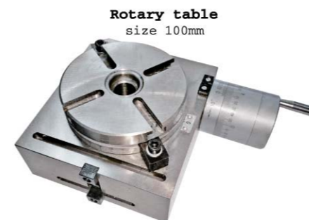
Rotary table size 100mm