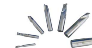
2 Flute Hss end mill

Bolt size:10mm include:12 studs, 6 step block pairs, 4 T nuts, 4 flange nuts, 4 coupling nuts, 6 end holddowns S/N:10047