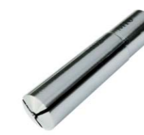
MT#3 collet set