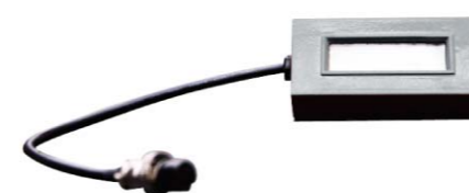
Digital spindle speed readout