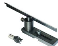
Wood tool rest with center