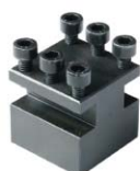
2 Way tool rest