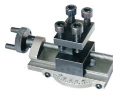
Angle cutter rest